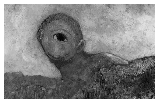
Detail of The Cyclops (about 1914) Odilon Redon. Oil on canvas. Kroller-Muller Museum, Otterlo, Netherlands.

When the young Dawn with fingertips of rose lit up the world, the Cyclops built a fire 1 and milked his handsome ewes, all in due order,