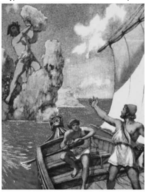
Detail of Odysseus and Polyphem (1910), after L. du Bois-Reymond. Color print. From Sagen des klasseschen Altertums by Karl Becker, Berlin.

This 1910 color print depicts Odysseus taunting Polyphemus as he and his men make their escape.